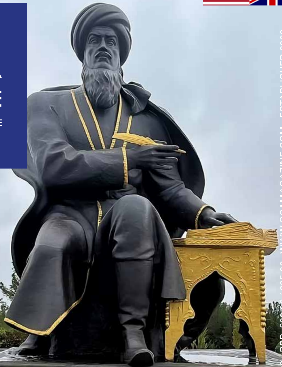
MAGTYMGULY 1724 - 1807

ISSN 2053-1036 RRP: £20.00 / $25.00 WWW.OCAMAGAZINE.COM ESTABLISHED 2009